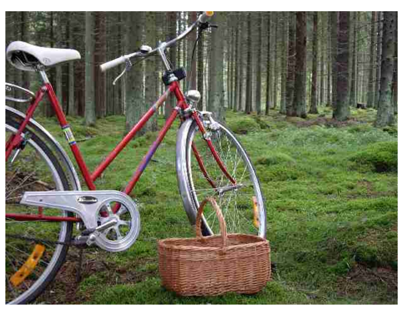
Mushroom forest, Småland, Sweden