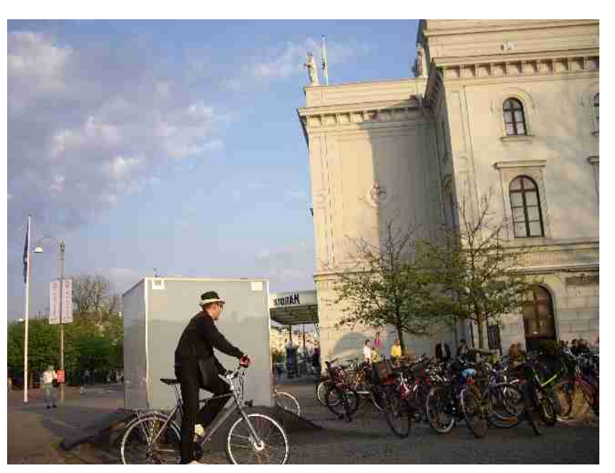
Avenyn, Gothenburgh, Sweden