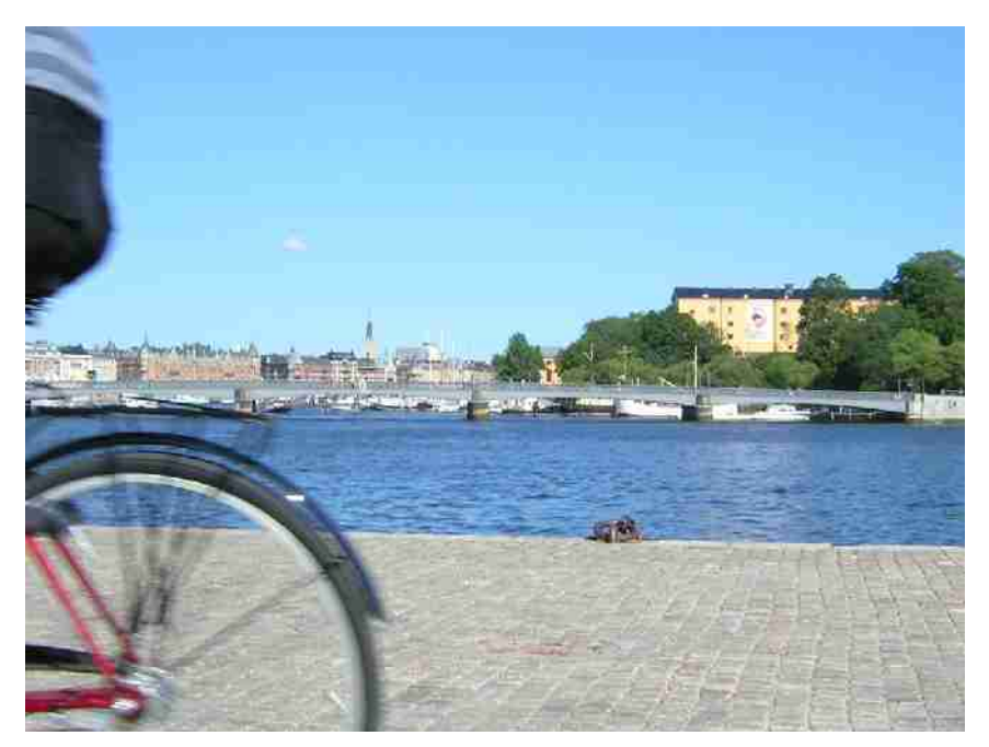
Skeppsbron, Stockholm, Sweden

Phone +46 70 65 10 194 E-mail pelle.envall@cycity.se